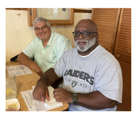
Good burgers enjoyed by all. Some enjoyed the cobbler and ice cream too! Good food! Good fun!