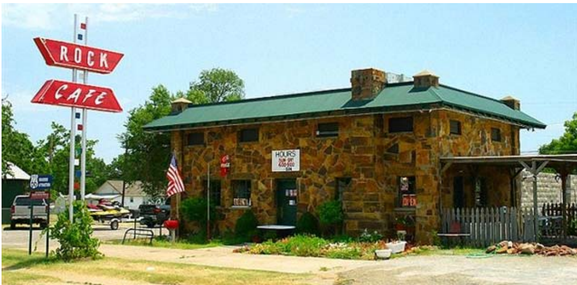
Photo of Rock Café in Stroud, OK before the devastating fire.