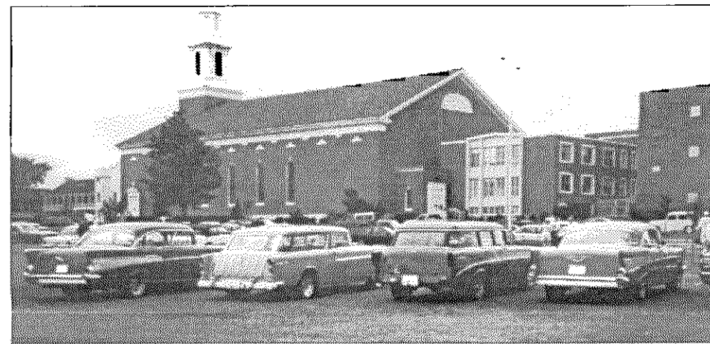
COCCC Photo by Sandy Buntin

This was the scene at just one of the stops on Cruisin' the Coast.