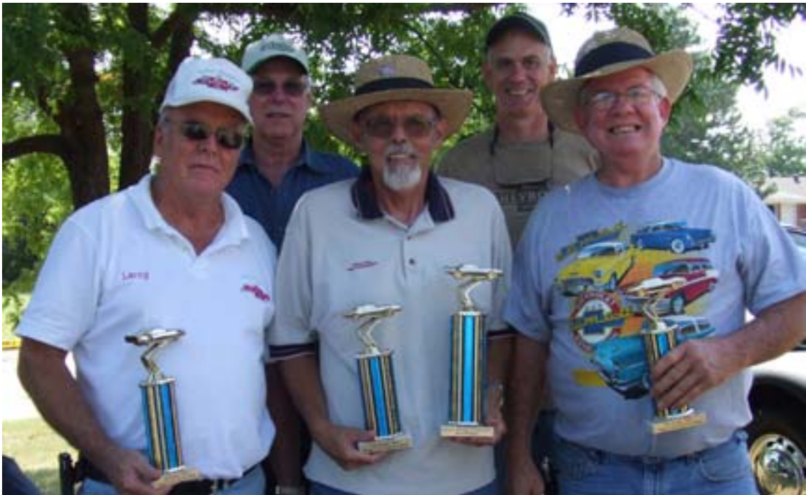
Winners at Two Pat's car show in Duffner Park