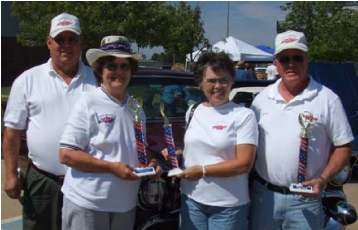
Winners at Perkins car show