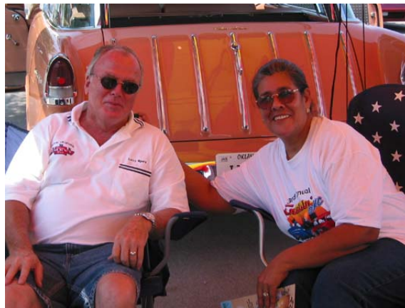
PHOTOS FROM CLAREMORE SHOW, SEPTEMBER 2002