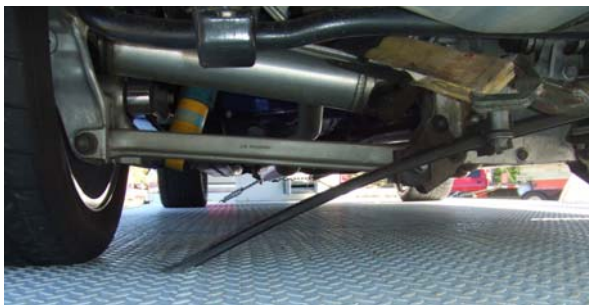
Broken rear spring on Myers' '57 Nomad