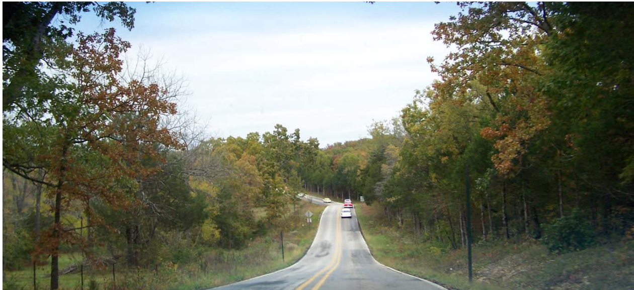
Fall Foliage tour 2006 Near Branson, MO