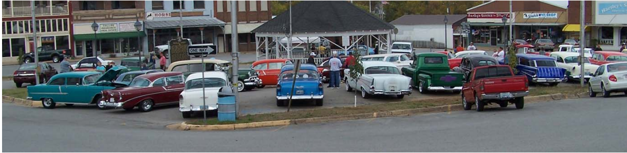
Classics taking over parking lot on tour.