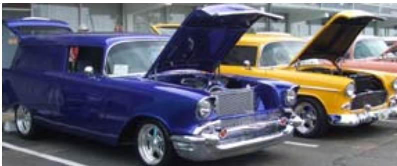
True Osborn's 1955 Nomad

1957 & 1955 Sedan Deliveries (look like some cars we know?) They travel together, but have one difference than True & Larry's cars. They have a capital "T" after their car number. They are trailered cars, but they are beautiful.