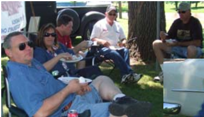
Some members attending the Brown Bag Picnic.