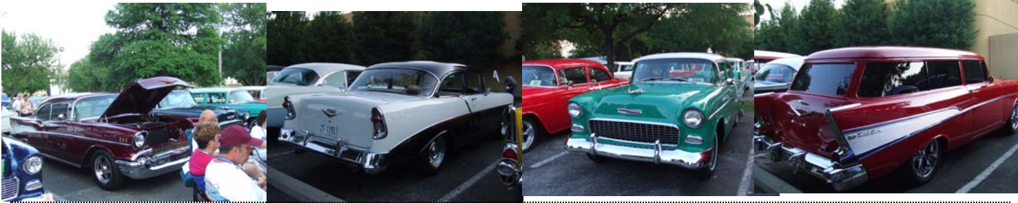
Members cars in Irving, TX