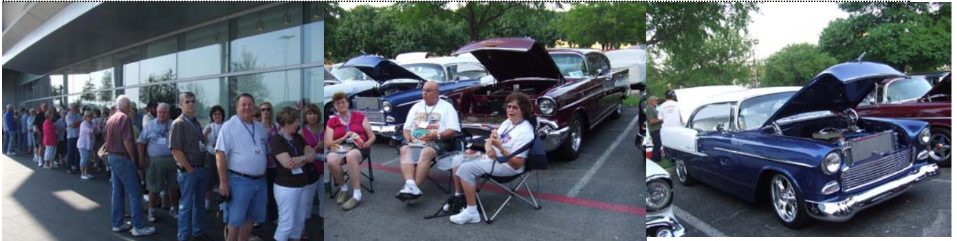
In line to go into Texas Stadium and sitting in the shade by the cars enjoying picnic.