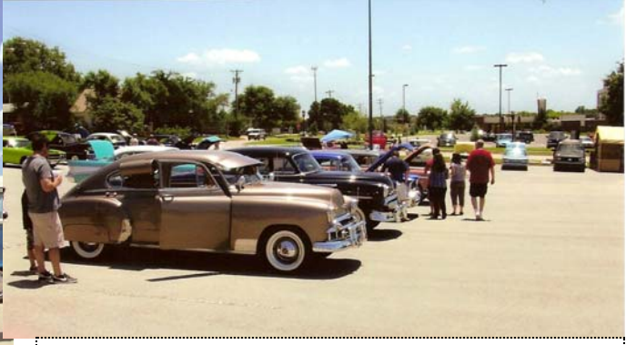
Club cars on display.