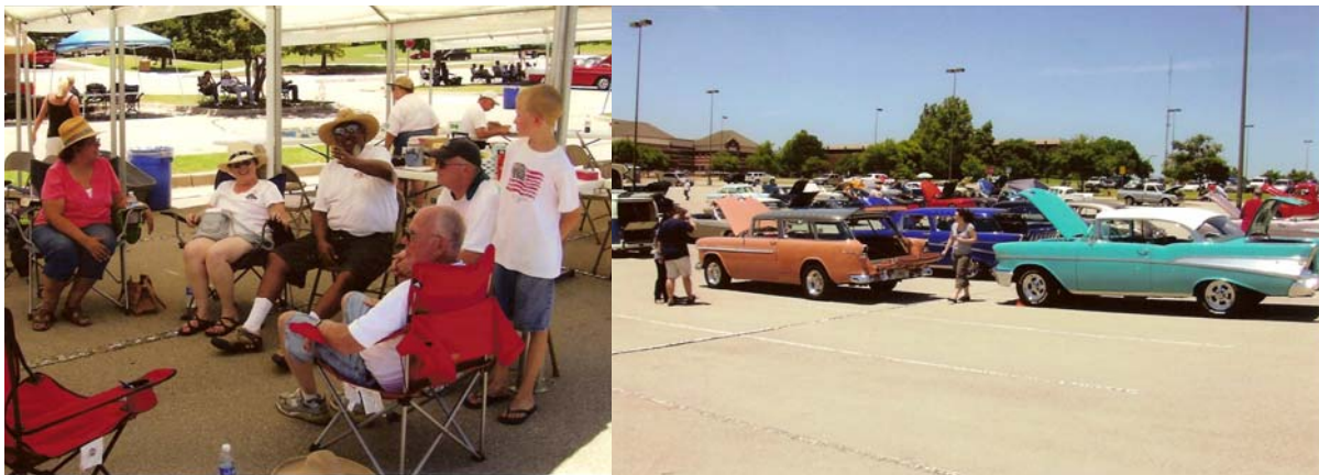
Some of the scenes from Liberty Fest Car show, June 26, 2010