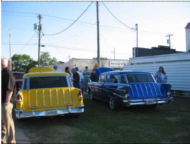
Osborn & Myers Nomads at J-Town Pizza, Jones. Members enjoying dinner cruise at J-Town Pizza. May 2005