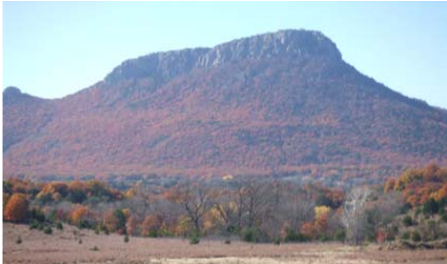
Scenery on the way to Meers

June 21 - 24, 2007 Route 66 Festival '07 Clinton, OK Info: www.route66festival2007.com